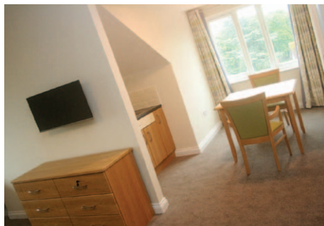
Light and airy rooms

All aspects of the full and varied activities programme run by the home is available to care suite residents as are the hairdressing facilities. The home has social co-ordinators who organise an active programme of crafts, games and hobbies as well as regular social events and visiting entertainers. All residents have complete choice over which activities they wish to join in.