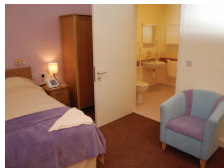
Home from home

Relatives and friends can register to view the latest care plan and daily reports on line through our website. The on-line system incorporates a high standard of security to ensure that each resident's information is secure.