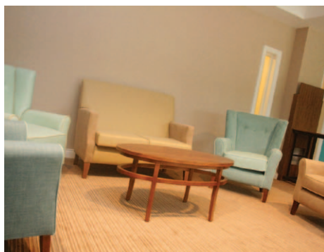
Spacious social areas

Residents of the suites have their own lounge and dining area. Meals are served in the dining room or residents can elect to have their meals delivered to their suite. Traditional home cooked food is offered using seasonal produce wherever possible. Our qualified chef is happy to provide alternative choices if requested. Special diets can be accommodated where necessary.