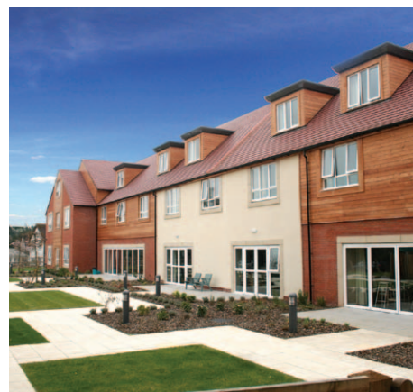
Plenty of garden space to enjoy

Residents must be in need of care and support and be compatible with the social environment. Individual care needs will be assessed at home or hospital prior to moving in.