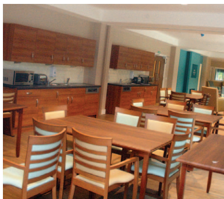
Communal dining rooms

Residents have the choice of using either the in-house team of carers and Registered Nurses, who are available at the home 24 hours a day, or any other CQC registered care provider. All in-house care staff undergo comprehensive training and the majority hold an NVQ qualification in care. If a resident wishes to purchase their care in-house, there is a Care Agreement drawn up prior to admission which covers both personal and nursing care.